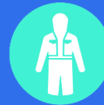
Medical Disposable Suits