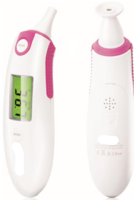
Ear Thermometer ET2C-KFT-22M

LCD, 3.5digits, 34X 21mm Packing: 45X 39X 53cm, 100 pcs/ctn, 13 kgs/ctn MOQ: 500 pcs Lead time: 75 days